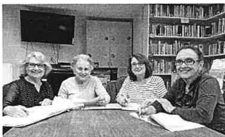
Memoir Writing Group