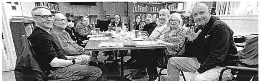
Yiddish Speaking Skills Group